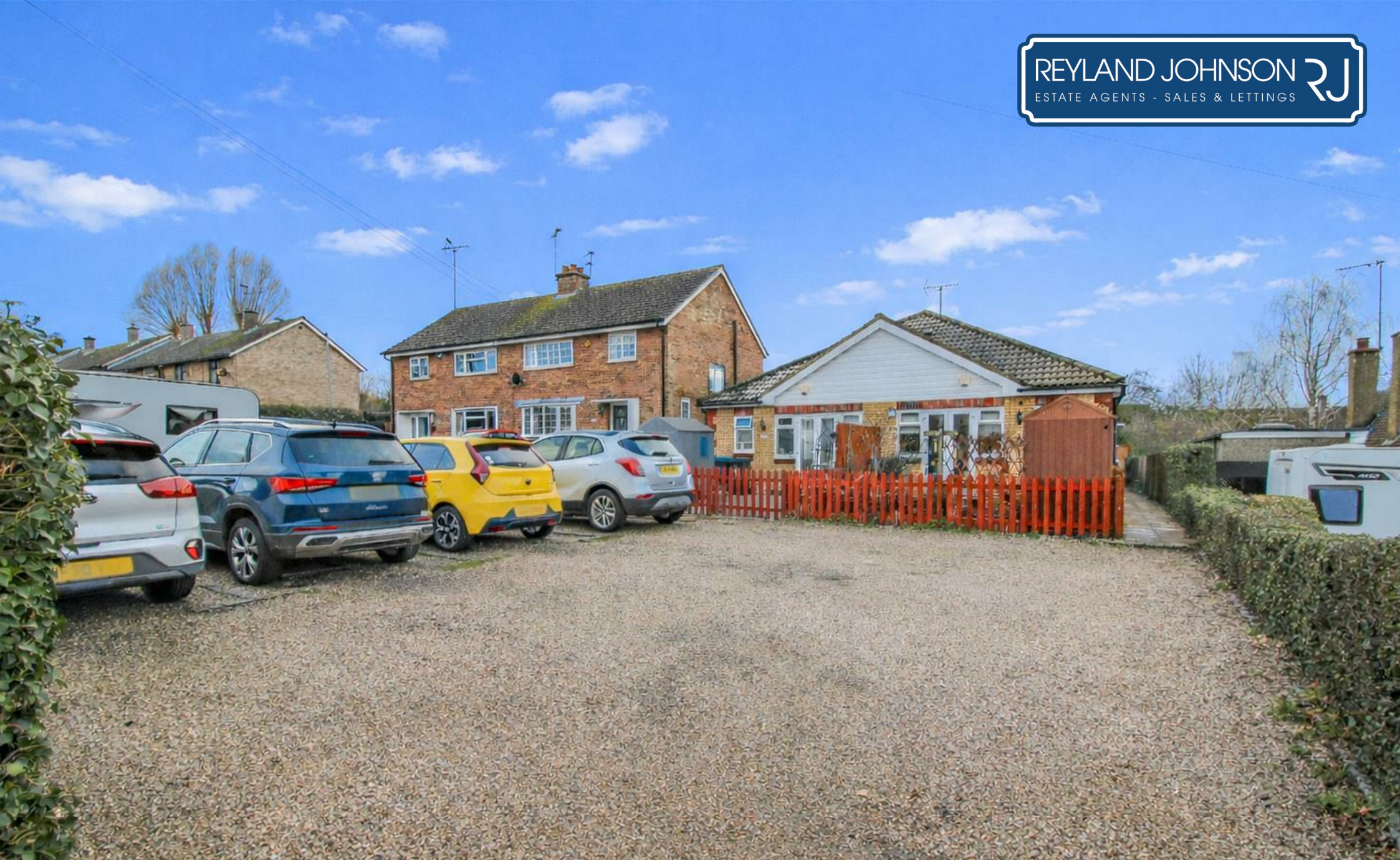
The Magpies, Harlow, CM17 9AW £270,000